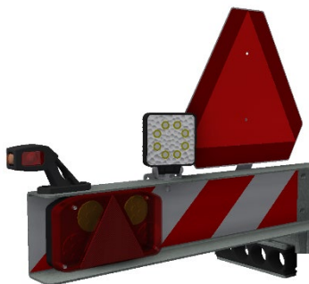
LED WORK LIGHTS