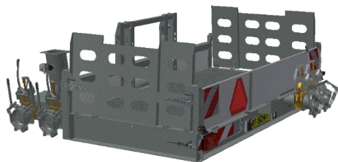
TOOLFRAME FOR QUAD AND WATERPUMP