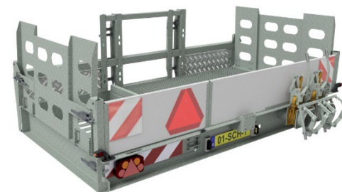
TOOLFRAME FOR QUAD + WATERPUMP