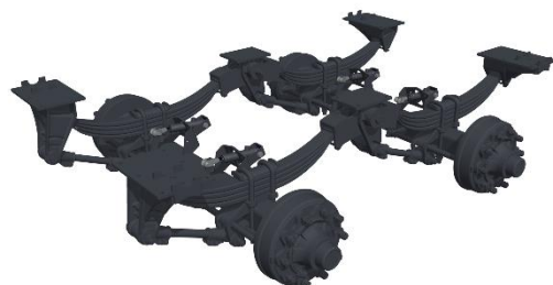
24 TONS PARABOLIC SPRING SUSPENSION