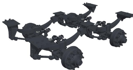
24 TONS PARABOLIC SPRING SUSPENSION